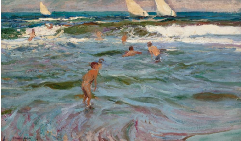
Joaquín Sorolla (Valencia 1863 – Madrid 1923), Niños en el mar , 1908, oil on canvas, 60 x 100cm

London; 8 November 2023 | Colnaghi is delighted to announce its new exhibition Sorolla: A Celebration of Life , opening at Colnaghi London on 1 December 2023. Coinciding with London Art Week, this seminal show, masterminded by three Spanish art professionals- Jorge Coll, Artur Ramon and Dámaso Berenguer- will feature masterpieces by Joaquín Sorolla (1863-1923), several of which have hitherto not come to market.