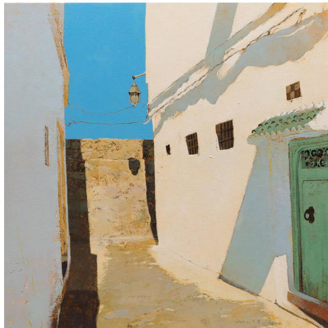
Left: Magí Puig (b.1966) Blau – Blue, oil on canvas, 65 x 65 cm (25 5/8 x 25 5/8 in) | £7,250