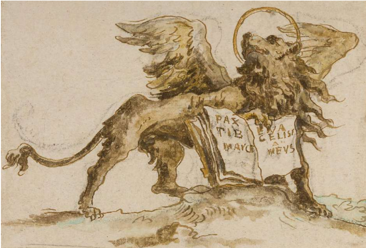
Stephen Ongpin Fine Art: Francesco Guardi (1712 - 1793), Lion part of this summer's exhibition of Venetian Drawings of the 18th Century

London Art Week is pleased to announce that this year's summer event will be held from Sunday, 3rd July to Friday, 8th July 2022 to accommodate changes in the busy art fair calendar and to allow international collectors and curators to be able to enjoy all that London galleries and auction houses have to offer in July.