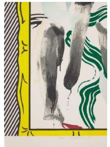
Roy Lichtenstein (1923-1997), Painting in a Gold Frame , 1983, original lithograph in nine colours, William Weston Gallery

London Art Week offers five thousand years of fine art for sale from a community of leading international dealers, every one of which is a specialist in their field. The event fosters a collegial approach to the sharing of knowledge between dealers, collectors and museum curators from around the world, to further the understanding and appreciation of art from antiquity to the present day, with a focus on Early, Renaissance, Baroque, Classical and Modern works of outstanding quality.