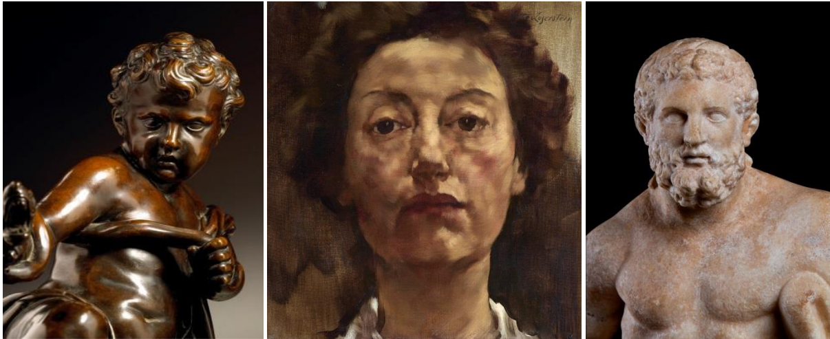
The Infant Hercules Wrestling a Snake , based on a model by Alessandro Algardi (1598-1654), French, late 17th century, bronze, Ht: 38.5cm, Tomasso ; Lotte Laserstein (1898-1993), Self-portrait en face , c. 1933, oil on unlined canvas, Agnews ; Farnese Hercules , Roman, 2nd Century A.D., marble, Ht: 55cm, Galerie Chenel