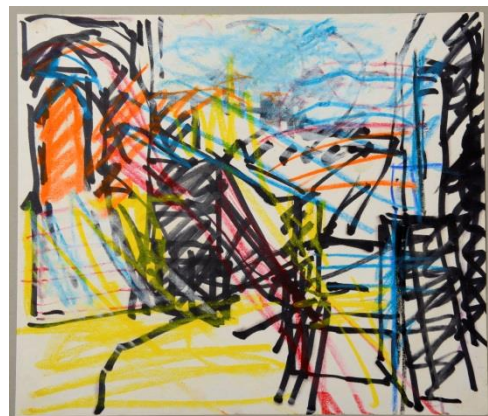
Gaspar van Wittel, called Vanvitelli (1652/3-1736), A view of Santa Maria della Salute, Venice , 1714, oil on canvas, Christie's ; Frank Auerbach (b. 1951), To the Studios , 1977, felt-tip pen and pastel on paper, Stephen Ongpin Fine Art