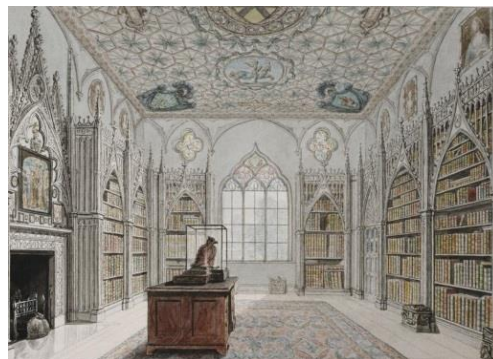
Albrecht Dürer, The Vision of St Eustace (detail), c. 1500-2, engraving, 36.1 x 26.2 cm (credit: The Trustees of the British Museum, London). Anton Schiterberg (doc. 1520–61), Armorial window of Hans Strüb of Unterwalden depicting a wild man and a wild woman, 1556, 43.5 x 32.6 (Sam Fogg); The Library at Strawberry Hill, c. 1790 (credit: The Lewis Walpole Library, Yale University)