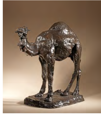
Albéric Collin, Arabian Camel, Exhibited Beelden Aan Zee

This summer, London Art Week will be launching, London Art Week DIGITAL, a new online platform that will augment in-gallery exhibitions, talks and shared scholarly values. The format enables London Art Week to support its unique community of international art dealers, auction houses, museums and sponsors, all working together in the creation of a special event online. A first for the Old Master and pre-contemporary art market, LAW DIGITAL will take place from 3 - 10 July, with a Private View on 2 July, and showcase the extraordinary range and quality of art available on the market.