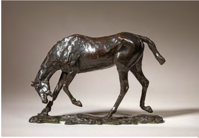
Edgar Degas, 'Cheval faisant une descente de main' Exhibited Shanghai