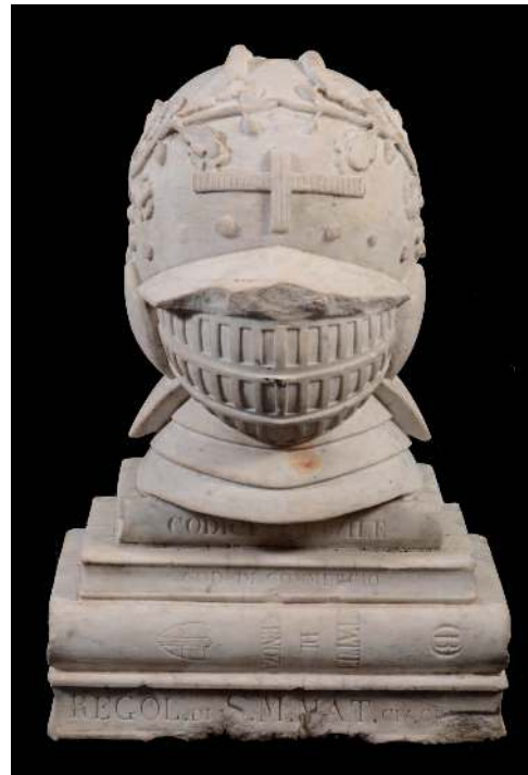
A knight's helmet, Genoa. 19th century. Marble, height 63 cm. BRUN FINE ART, 38 OLD BOND STREET, W1S