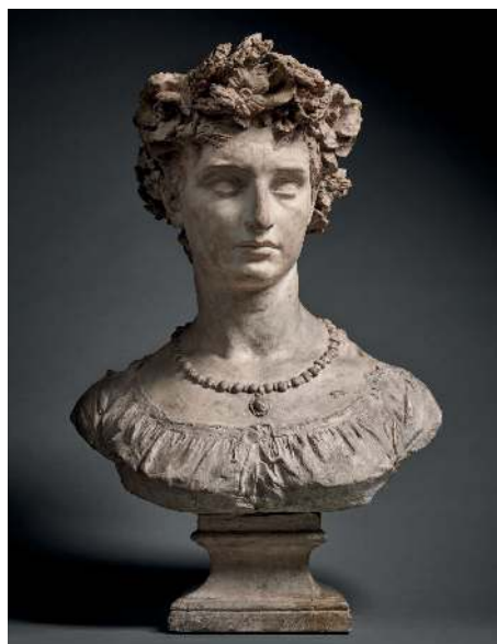
L'Été, by Jean-Baptiste Carpeaux (1827–1875). Plaster, height 67 cm. DANIEL KATZ GALLERY, 6 HILL STREET, W1J

LONDON ART WEEK will bring together an exciting programme of dealer exhibitions and old-master auctions to London's West End. Many of the forty or so participants will present curated displays, often painstakingly accumulated over many months or even years. Here we highlight a small selection.