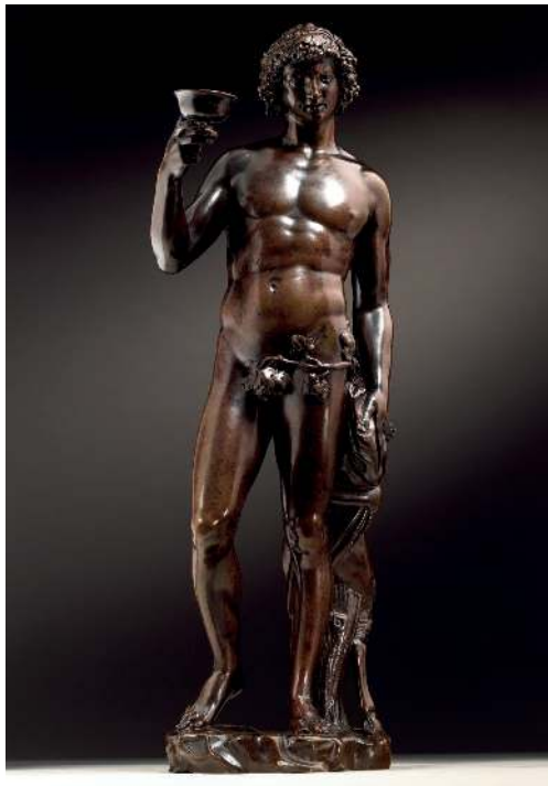
Bacchus and a young satyr , by Giovanni Battista Foggini (1652-1725). Bronze, height 46 cm. TOMASSO BROTHERS FINE ART, 67 JERMYN STREET, SW1