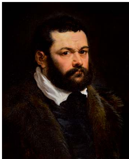
Portrait of a bearded Venetian nobleman, by Peter Paul Rubens (1577–1640). Panel, 60 by 48.6 cm. SOTHEBY'S, LONDON. OLD MASTERS EVENING SALE, 4TH JULY, 34–35 NEW BOND STREET, W1A