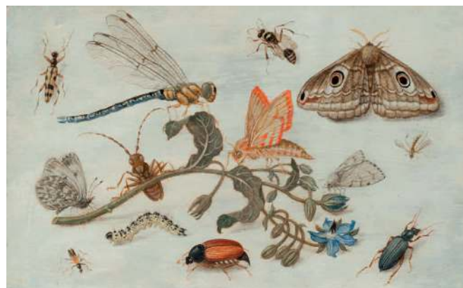
Study of insects and a borage stem, by Jan van Kessel the Elder (1626–1679). c.1660. Oil on paper, 10.4 by 34.7 cm.

CARETTO AND OCCHINEGRO. EXHIBITING AT: 21 GEORGIAN HOUSE, 10 BURY STREET, SW1