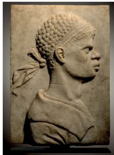
A Saraceni's head , probably Florence. c.1300-1320. Marble, height 47 cm. GALLERY DESMET. EXHIBITING AT: 40-41 DUKE ST, SW1