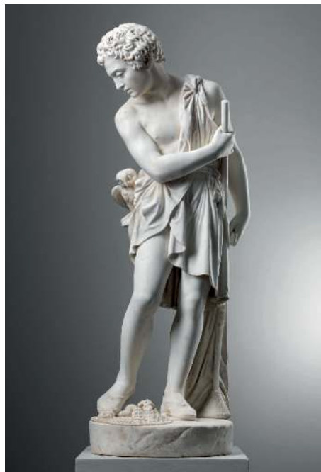
The genius of the hunt, by Pompeo Marchesi (1790–1858). c.1830–35. Marble, height 133 cm. TRINITY FINE ART, 15 OLD BOND STREET, W1S