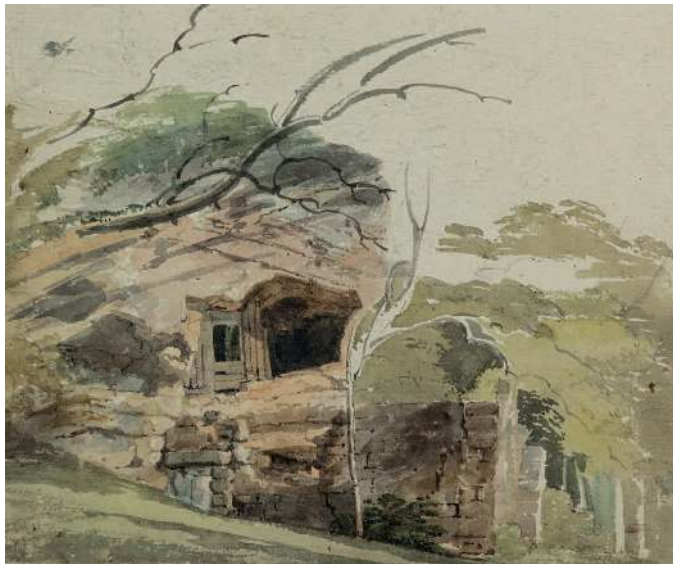
Warkworth Hermitage, Northumberland , by Thomas Girtin (1775-1802). 1796. Pencil and watercolour, 25.5 by 30.4 cm. JAMES MACKINNON FINE ART. EXHIBITING AT: 73 NEW BOND STREET, W1S