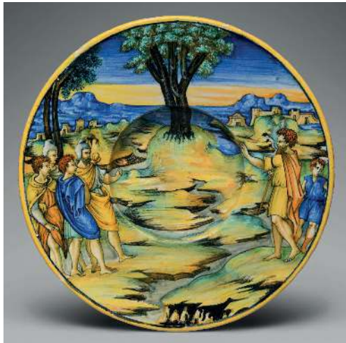
Aeneas and Achates taking their leave from the other Trojans on the Libyan coast near Carthage , by an unidentified painter close to the 'Milan Marsyas' painter, Urbino. c.1530. Tin-glazed earthenware, diameter 25.5 cm. RACCANELLO LEPRINCE. EXHIBITING AT: 32 ST GEORGE STREET, W1S