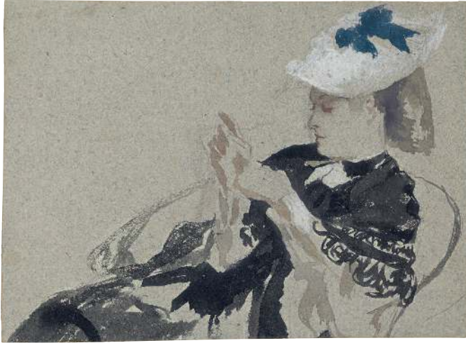
A scated young woman , by James Jacques-Joseph Tissot (1836-1902). Pencil, black wash, watercolour and gouache on blue-grey paper, 14.5 by 19.9 cm. STEPHEN ONGPIN FINE ART, 6 MASON'S YARD, SW1