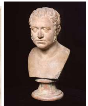
L to R: An Italian carved white marble sculpture of a Knight's Helmet , Genoa, 19th century, Brun Fine Art ; Juan Gris, Nature morte a la guitare , 1920, gouache, 336 x 278 mm, Artur Ramon Art ; Robert Adam, design for The Dundas Sofas , 1765, executed by Thomas Chippendale (1718-1779), from the Thomas Chippendale 300 Years sale, 5 July 2018, Christie's ; Pompeo Marchesi (1789-1858), Portrait of Henry Beyle, called Stendhal (Grenoble 1783-Paris 1842), 1814-1821, terracotta, 55 cm high with socle, Callisto Fine Art