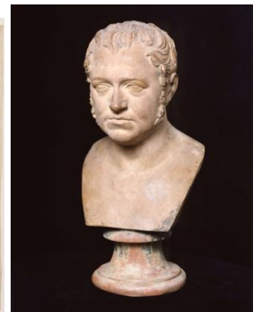
L to R: An Italian carved white marble sculpture of a Knight's Helmet , Genoa, 19th century, Brun Fine Art ; Juan Gris, Nature morte a la guitare , 1920, gouache, 336 x 278 mm, Artur Ramon Art ; Robert Adam, design for The Dundas Sofas , 1765, executed by Thomas Chippendale (1718-1779), from the Thomas Chippendale 300 Years sale, 5 July 2018, Christie's ; Pompeo Marchesi (1789-1858), Portrait of Henry Beyle, called Stendhal (Grenoble 1783-Paris 1842), 1814-1821, terracotta, 55 cm high with socle, Callisto Fine Art